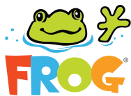
POOL FROG ® 25K

In-ground or soft-sided, FROG has a Fresh Mineral Water ® sanitizer for any pool size or type.