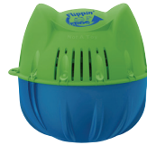
Flippin' FROG® for Intex® style* above ground pools 2,000 to 5,000 gallons