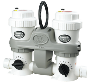
XL PRO® System with X-tended Pac Life up to 40,000 Gallons