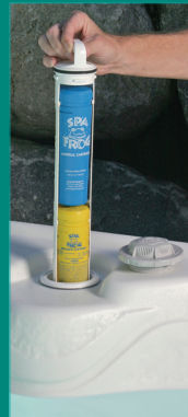
In-Line Mineral System Built In by the Spa Manufacturer for New Spas up to 600 Gallons