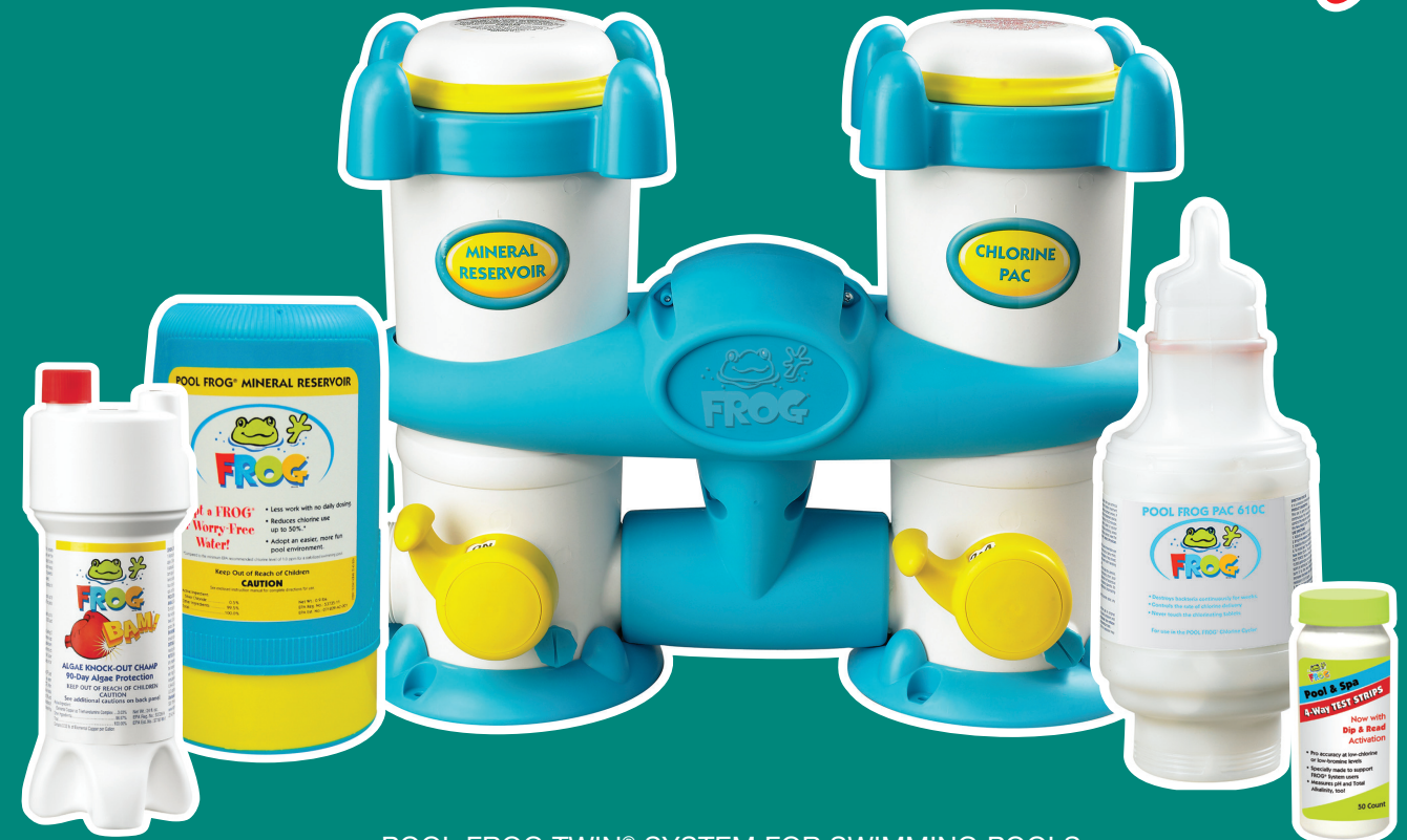
POOL FROG TWIN® SYSTEM FOR SWIMMING POOLS UP TO 25,000 GALLONS