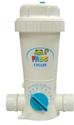
Mineral System up to 40,000 Gallons