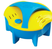
INSTANT FROG® Mineral Disinfectant for In Ground Skimmers up to 25,000 Gallons