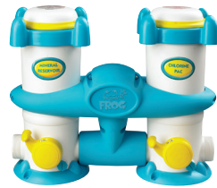
POOL FROG Twin® Mineral System up to 25,000 Gallons