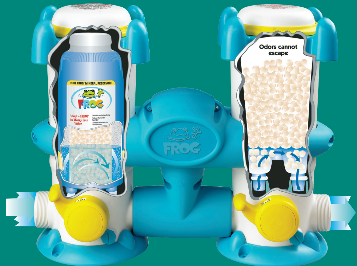
Set Mineral Cycler to ON