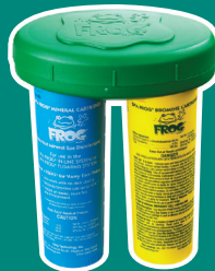
Floating Mineral System Floats in Any Spa up to 600 Gallons